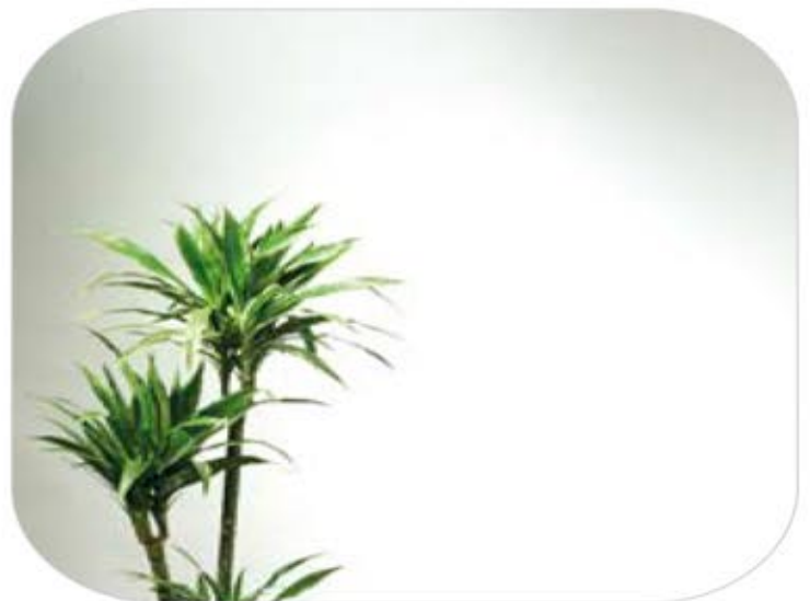
Pilkington Optimirror™ OW